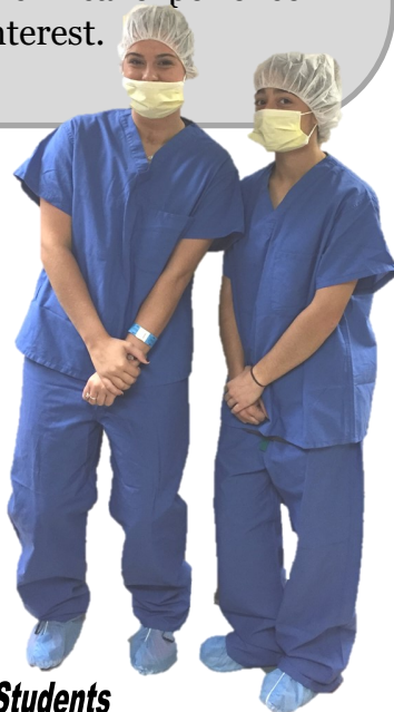
GCHS Health Science Students