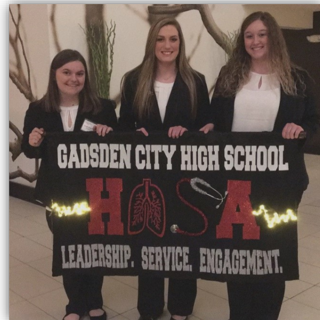
2017-18 Gadsden City High School HOSA members

HOSA is a national student organization endorsed by the U.S. Department of Education and the Health Science Technology Education Division of ACTE.